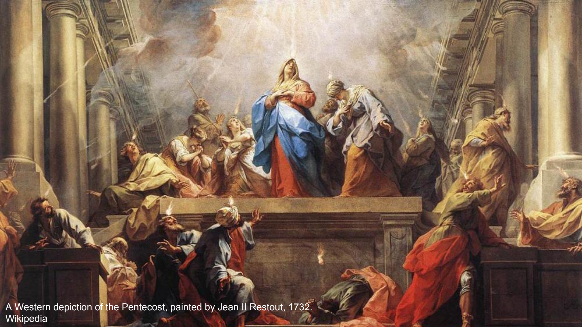
A Western depiction of the Pentecost, painted by Jean II Restout, 1732. Wikipedia