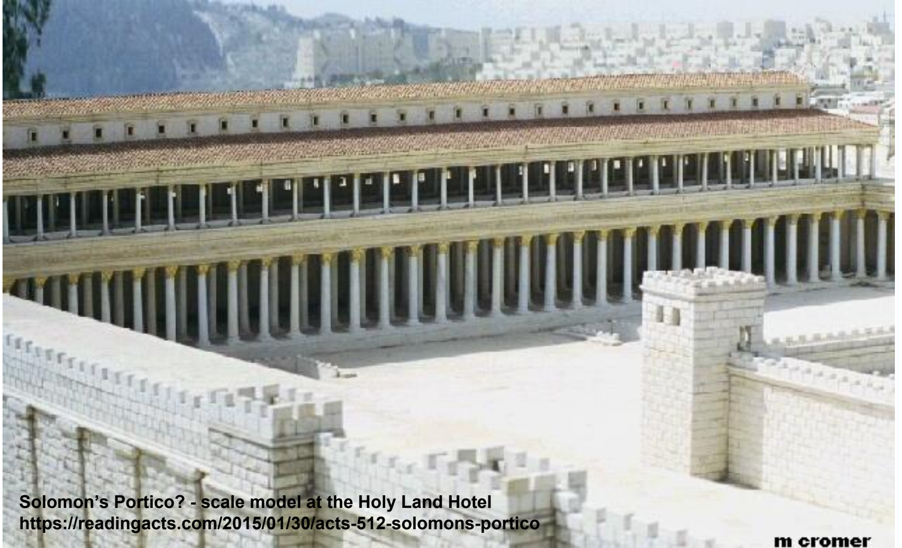
Solomon's Portico? - scale model at the Holy Land Hotel