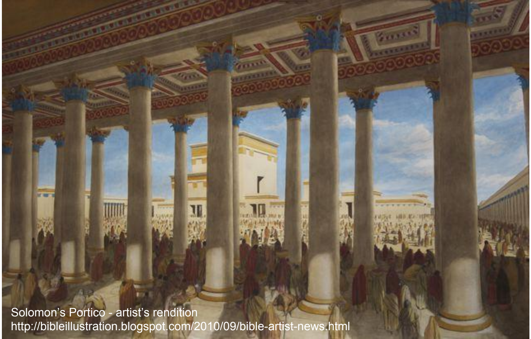
Solomon's Portico - artist's rendition

http://bibleillustration.blogspot.com/2010/09/bible-artist-news.html