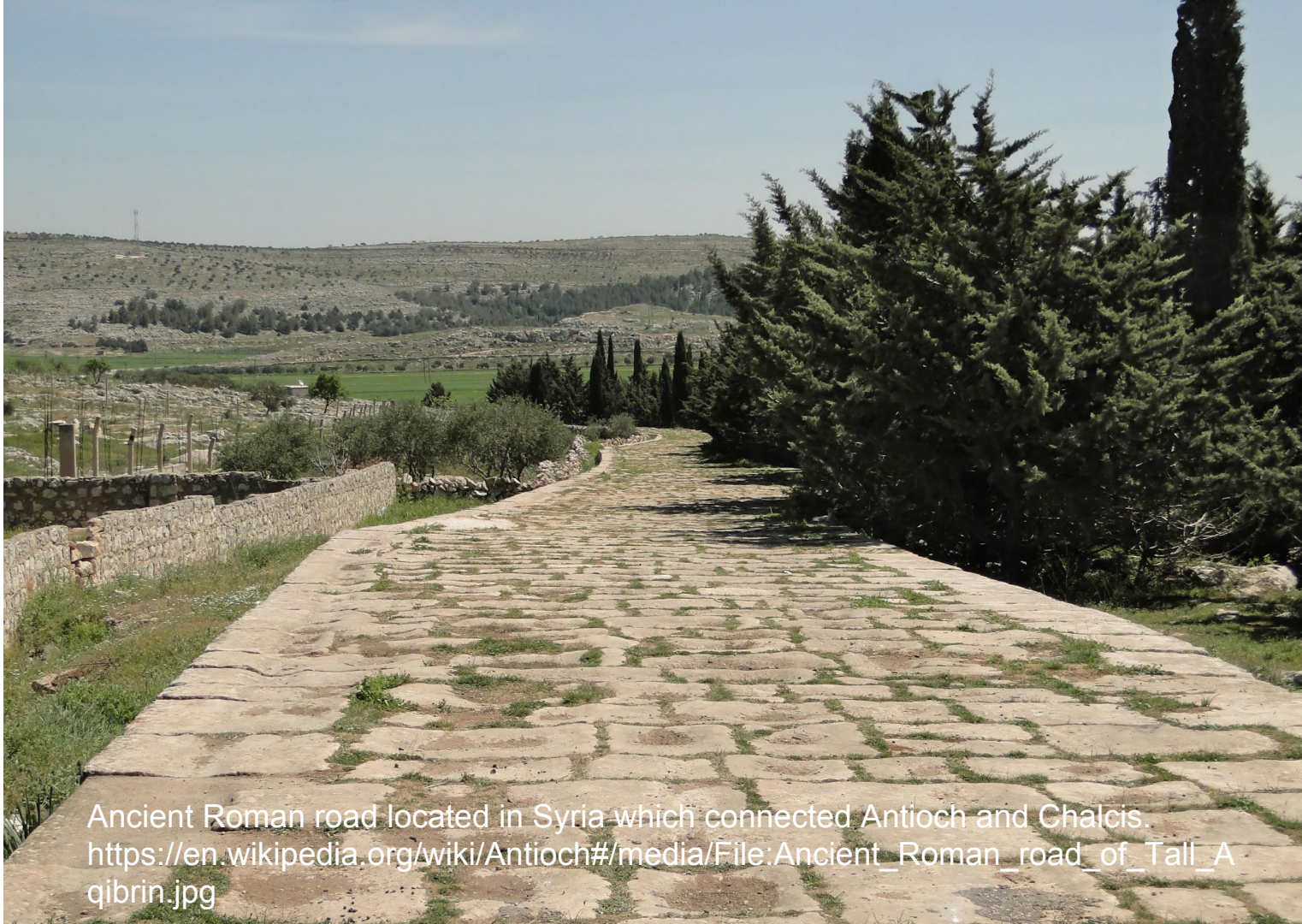
Ancient Roman road located in Syria which connected Antioch and Chalcis.