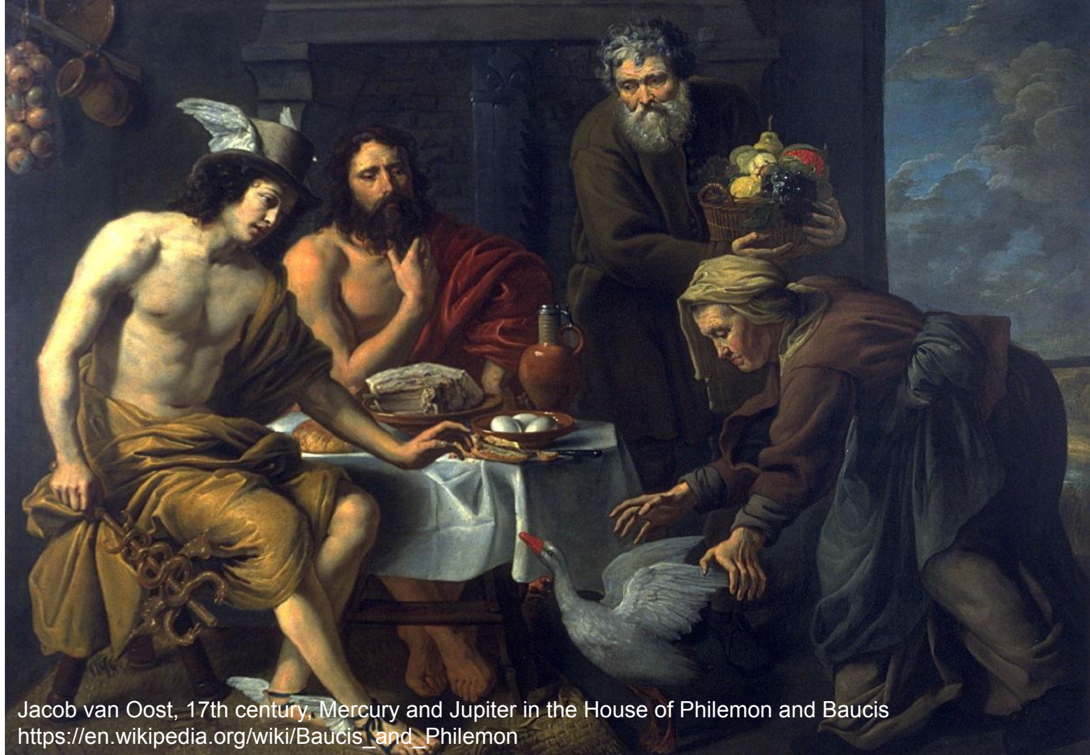
Jacob van Oost, 17th century, Mercury and Jupiter in the House of Philemon and Baucis https://en.wikipedia.org/wiki/Baucis_and_Philemon