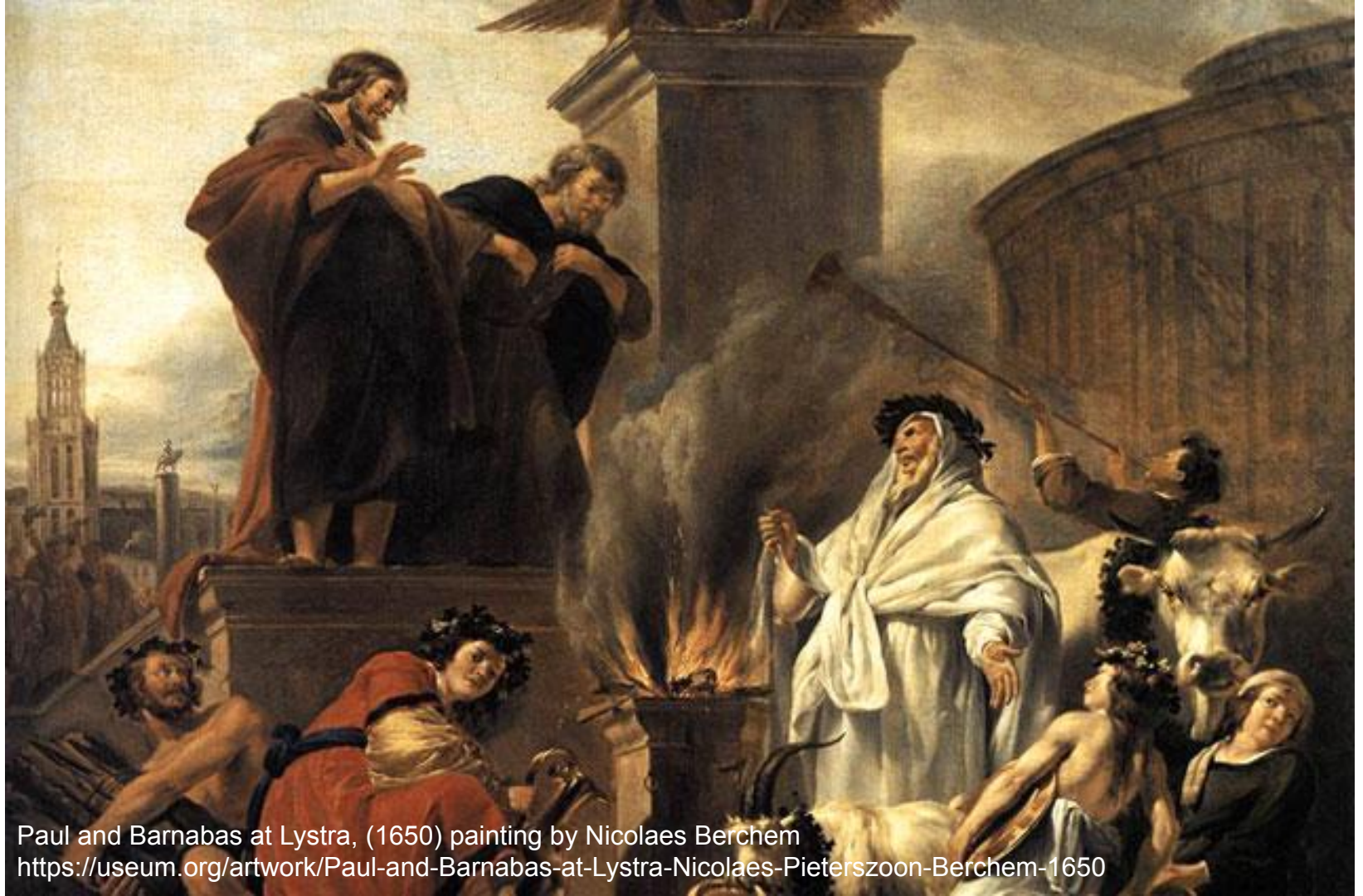
Paul and Barnabas at Lystra, (1650) painting by Nicolaes Berchem https://useum.org/artwork/Paul-and-Barnabas-at-Lystra-Nicolaes-Pieterszoon-Berchem-1650