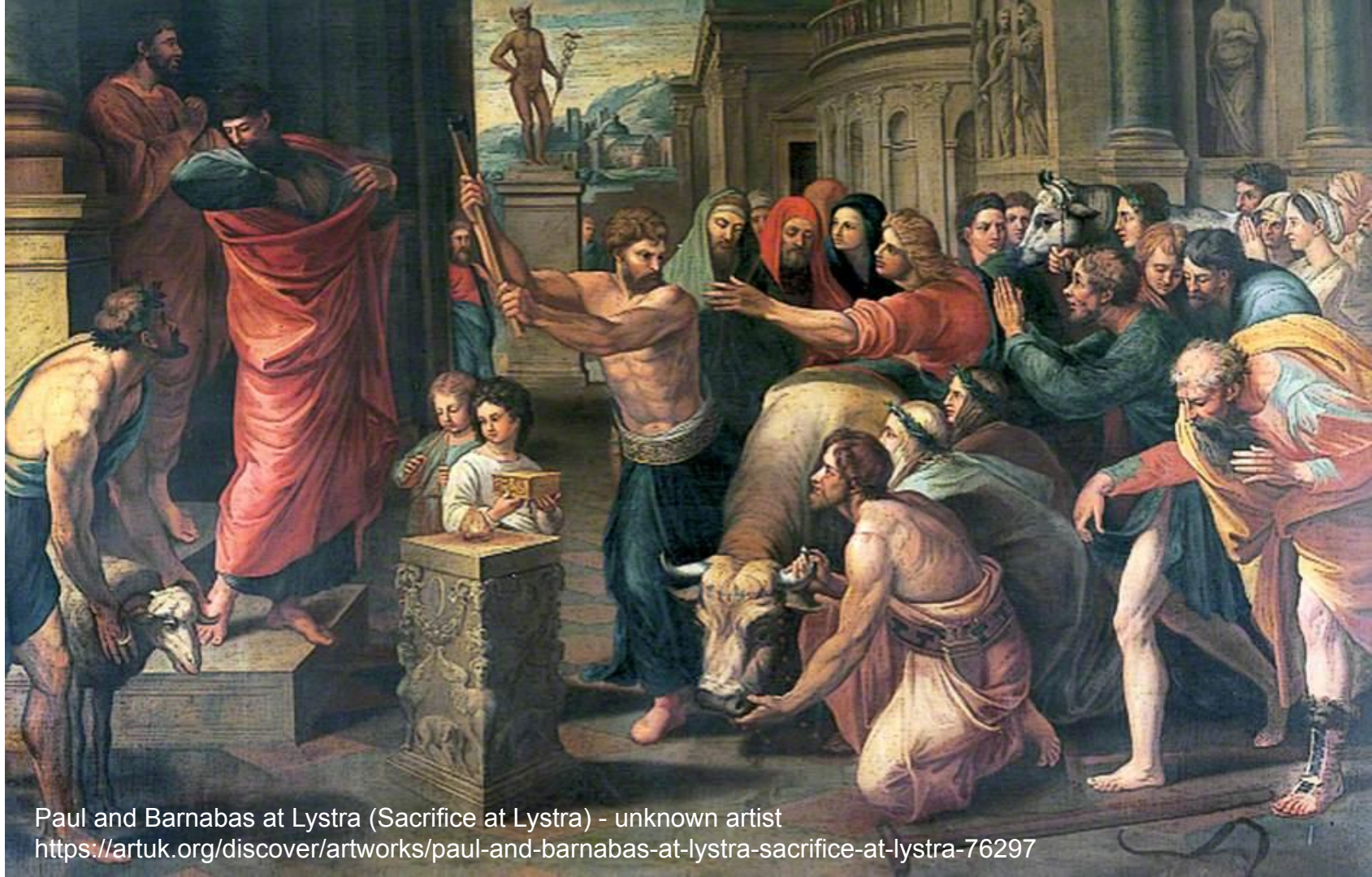
Paul and Barnabas at Lystra (Sacrifice at Lystra) - unknown artist

https://artuk.org/discover/artworks/paul-and-barnabas-at-lystra-sacrifice-at-lystra-76297