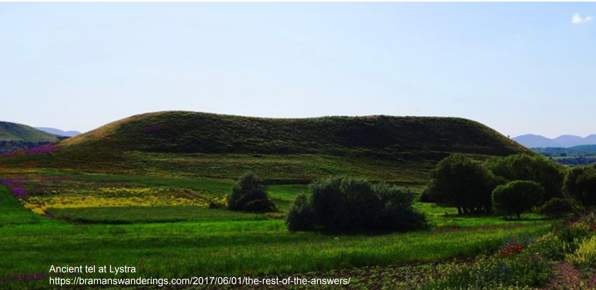
Ancient tel at Lystra https://bramanswanderings.com/2017/06/01/the-rest-of-the-answers/