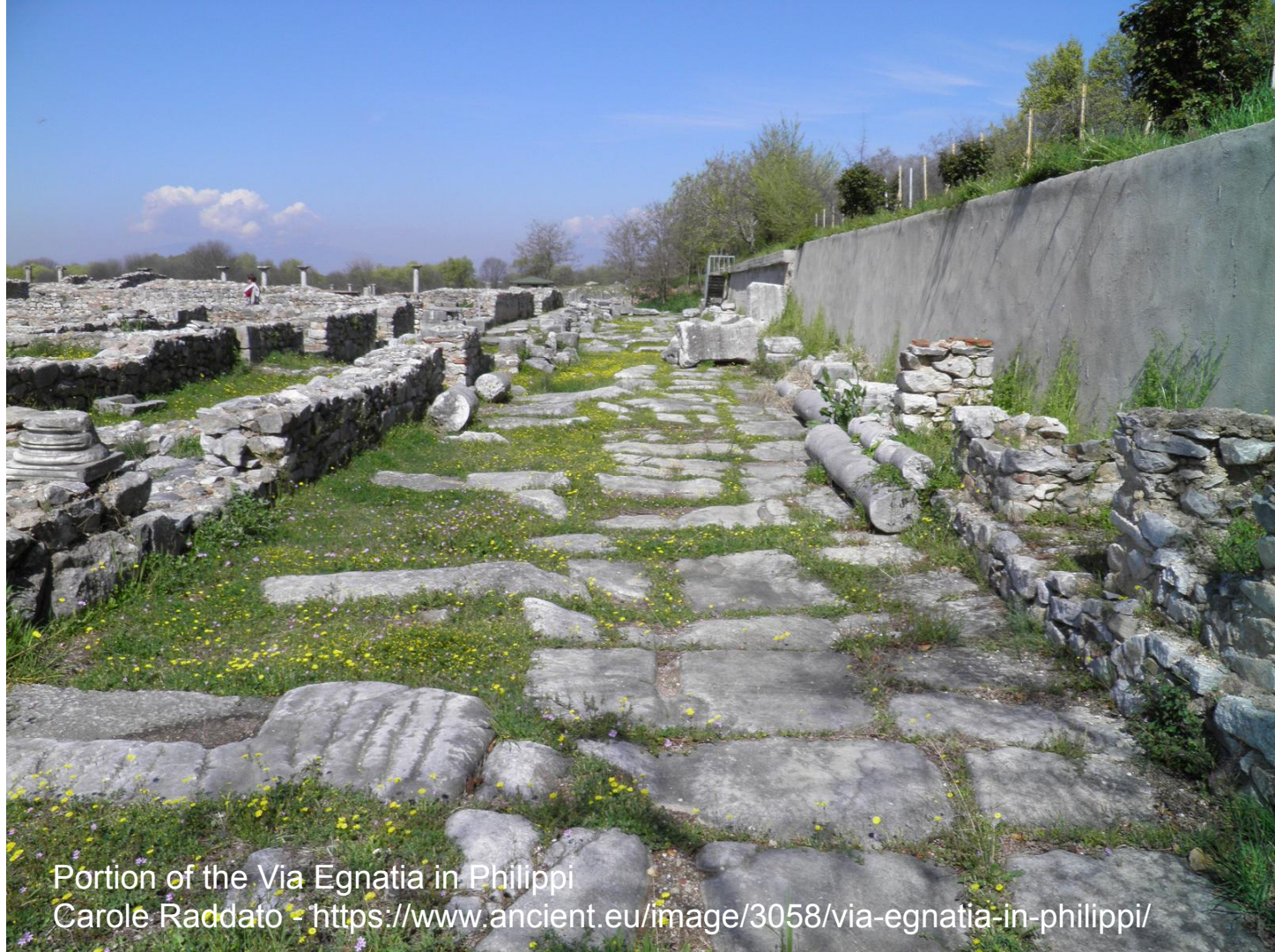
Portion of the Via Egnatia in Philippi