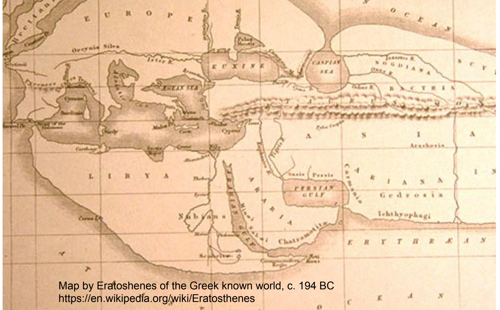
Map by Eratosthenes of the Greek known world, c. 194 BC https://en.wikipedia.org/wiki/Eratosthenes